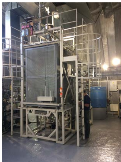
Figure 1. Front view of the scaled-up plant for catalytic growth of carbon nanotube spools.